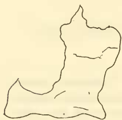
FIG. 1.—CHARACTERISTIC FORM OF PHOSPHATIC MINERAL IN BLUFF, FAYETTE COUNTY, METEORITE. ACTUAL SIZE ABOUT 1.5 MM. IN GREATEST DIAMETER.

Concerning the stone of 1878, little more need be added to what is given in the paper referred to above. A broken surface shows a dense, dark-brown stone, very indistinctly chondritic and with none of the mineral constituents determinable by the unaided eye. A freshly polished surface is of a greenish-gray cast and shows abundant flecks of metal, but the chondritic structure still remains obscure (see fig. 1, pl. 86). On going over the sections a second time I find the colorless interstitial mineral full of gas cavities,